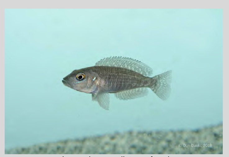
exLamprologus calipterus female

If you want the real deal that mimics Lake Tanganyika, you'll need to go in search of Neothauma shells. Good luck finding them