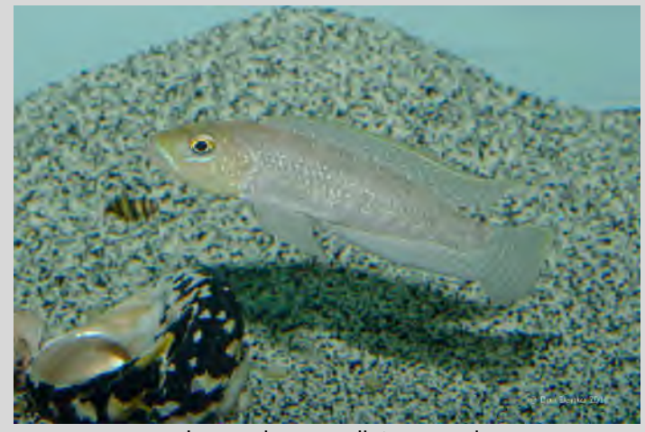
exLamprologus calipterus male

For nice aesthetics, I like to use small shells, like Murex, Delphinia, Turbo, etc. They can easily be found on line on Ebay or through a Google.com search. To a mix of these shells, I add sand for a pleasing appearance and to give the fish something to move around.