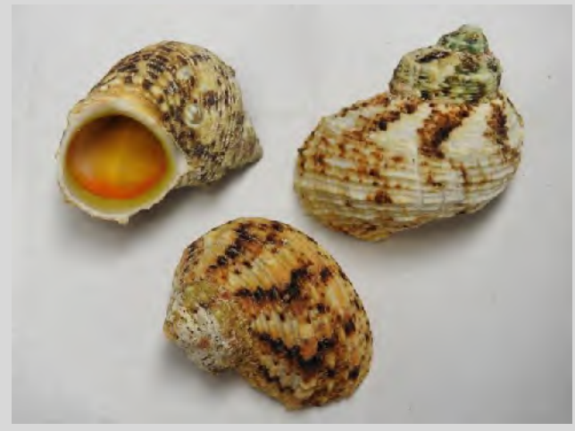
Gold Mouth Turbo

The first consideration when setting up the breeding sites for Shell Dwellers is what is the look that you're after? Do you want a natural looking tank that is true to nature? Do you want an aesthetically pleasing tank that doesn't necessarily have to mimic conditions in Lake Tanganyika? Or, are you only interested in breeding that and are not worried about aesthetics?