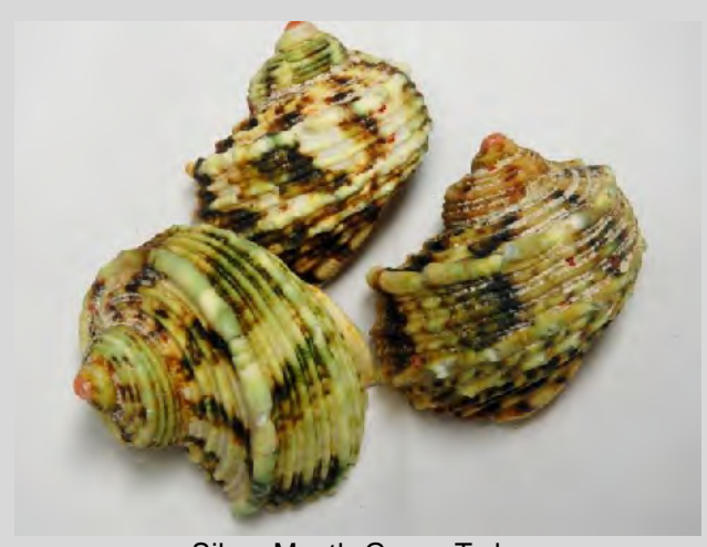
Silver Mouth Green Turbo