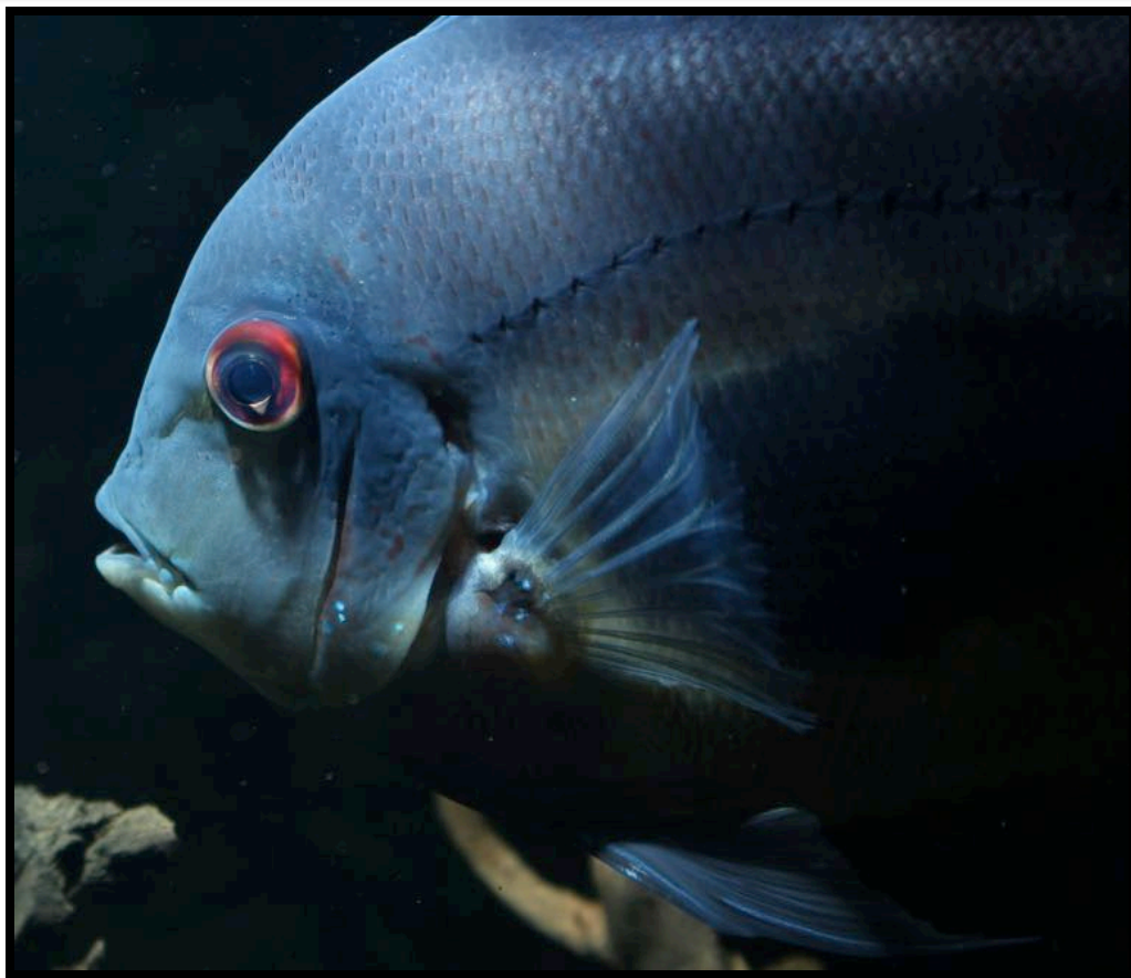
Uaru amphiacanthoides South America