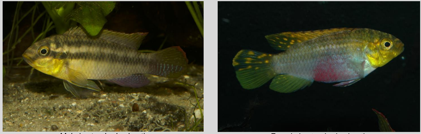
Male in standard coloration

For more than 35 years, I have been working with the cichlids of West and Central Africa. While many of the cichlid species found in this region have only spent a limited amount of time in my aquaria, there are a few species that I have maintained over extended periods of time, in some cases for more than 10 years, as they have proven to be such interesting aquarium subjects. There is one species in particular that has spent a significant amount of time in my aquaria, in fact since 1981. Pelvicachromis silviae , formerly known as P . sp. aff. subocellatus , has enjoyed an almost unbroken presence in my cichlid collection. In the curious way of our hobby, it was surprising that, for about 50 years, this regularly imported dwarf cichlid from Nigeria had not been formally described and given its own scientific name, until I described it as P. silviae . I named it after my wife as a little "Thank you" for her patience and support of my scientific as well as aquaristic interest during all the years we've been together.