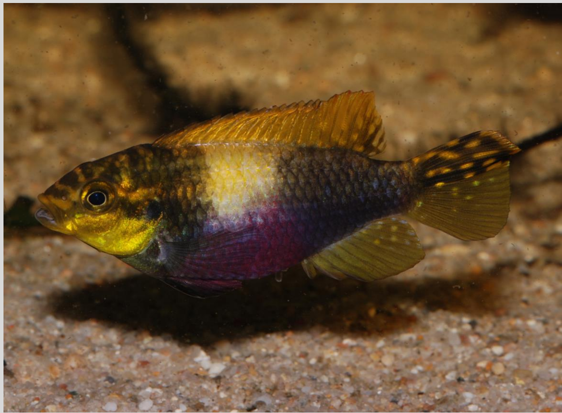
Courting female, this coloration they only show when they have to compete against other females

The sexual dimorphism of this species is well established, with differences in coloration between the male and female exhibited in their fins. Males show extensions to the first rays of the pelvic fins and both the anal and dorsal fins. Additionally, the caudal fin of mature males may show extended rays in the upper lobe. The dorsal fin has a red outer border, and the soft parts of both the dorsal and anal fin exhibit a pretty pattern of pale blue and red dots. The lower area of the caudal fin displays a yellow band.