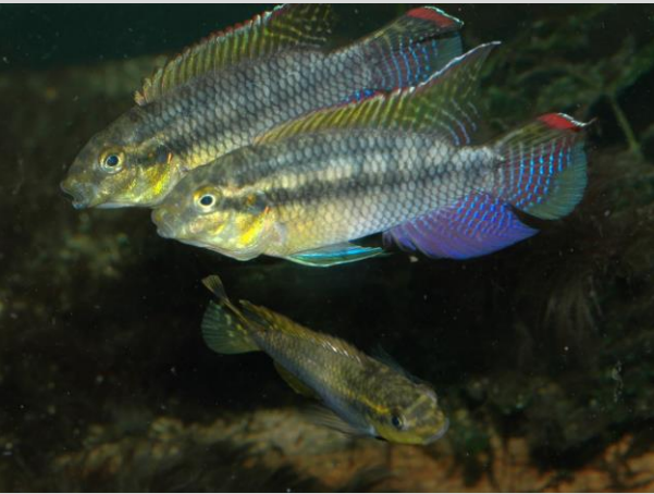
Two males fighting for a female

bright metallic blue area. The caudal fin will become dark and smoky with bright yellow spots. Overall, this is a fantastic look, as hopefully the images illustrating this article will show.