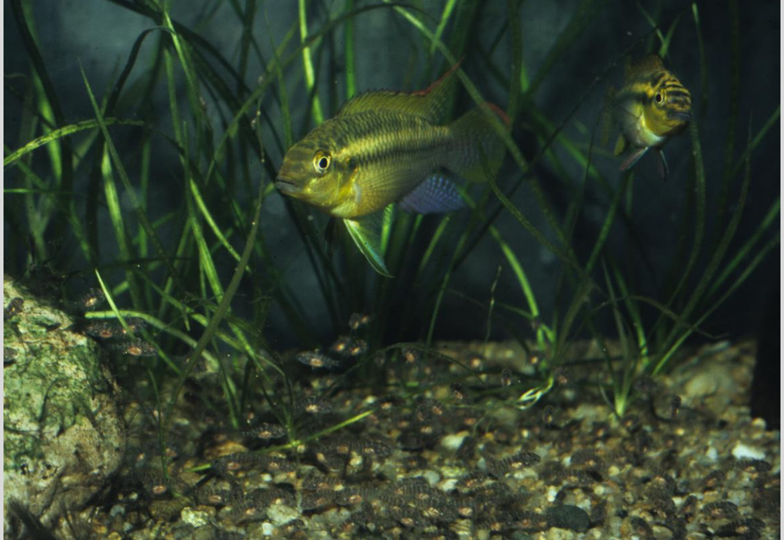
My first pair I could breed with, this was in the early 80's

unnatural, as it also appears to shorten the lifespan. A scientific investigation revealed that after spending some time in our aquaria, more than 90% of our fish have elevated levels of liver fat!!