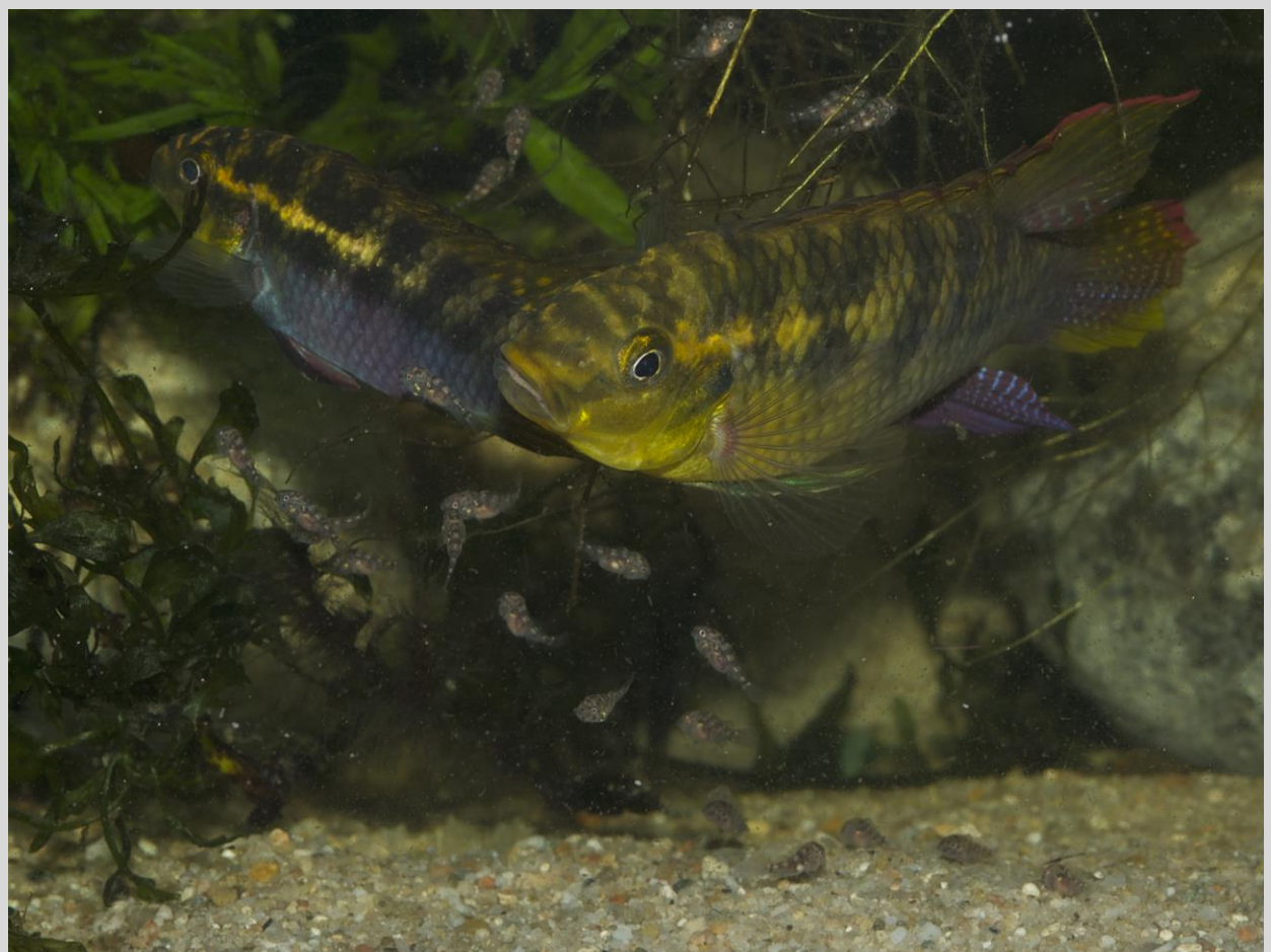
Pair with fry about 3 weeks old

of. The female's coloration also changes; she is now more inconspicuous, as the red belly disappears, as does the bright yellow in the face and fins. At this time, she displays the dark longitudinal bands, and may also show the vertical bars as well. This coloration signals the ongoing development of the larvae, which after 3 days should have hatched. The intensity of these longitudinal markings (a feature also typically displayed by other members of the genus Pelvicachromis during brood care) may be significant to the parents' control of the juveniles.