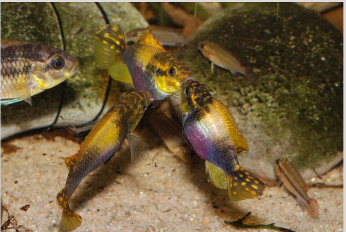
Females competing for a male...which one is the most beautiful babe for him?

When it comes to describing the water conditions this species should be kept in, we can only guess, due to the uncertainty surrounding the actual location in which this species can be found in the wild. That guess is based on the available knowledge of the area, and of course, experiences gained from maintaining and breeding this species in the aquarium.