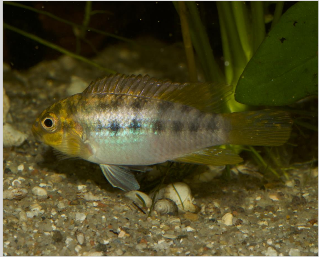
Female with freshly hatched fry

Pair formation can be a lengthy process, sometimes lasting several weeks, although in some cases, all that is required is 1 or 2 days. During the pair formation process it is the female that is most active. She will swim in the vicinity of her chosen male, who will be showing off his magnificent colors. While near the male, the female will shape her body into a "U" or "S" shape and shake her body in a series of rapid tremors. During this process she will display very strong colors; in particular her abdomen will be a vivid dark red to purplish red coloration. If the chosen male fish is receptive, he will respond in a similar manner, but instead of bending his body, he will hold it rigidly. Once the pair have bonded, you will see them eating and swimming together. They will also begin to chase intruders away from their chosen territory. The focus of their territory is always a cave, which on most occasions is chosen by the female. I would recommend placing several caves to permit the pair to choose their own preferred site. Particularly popular are those caves that have a relatively small entrance, just big enough for the female to pass though. Alternative cave choices include tubes, spherical cavities, or stones placed together. It should be remembered that each pair will have its own criteria for choosing a suitable cave, and not all will choose the same site or type of cave.